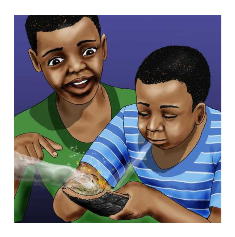
Tingnan mo, may apoy!