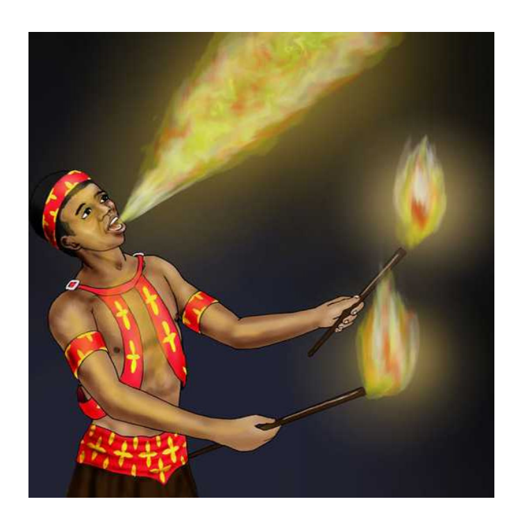
Tingnan mo, may apoy!