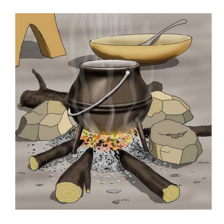
Nakaluluto ang apoy.