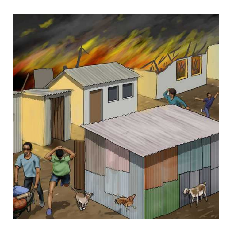
At makapangyarihan ito.