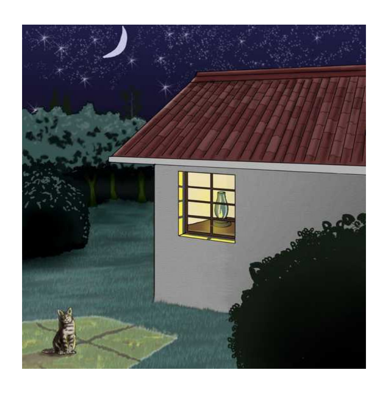
Nagbibigay-liwanag ang apoy.