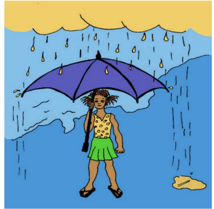
Roob baa da'ayo.