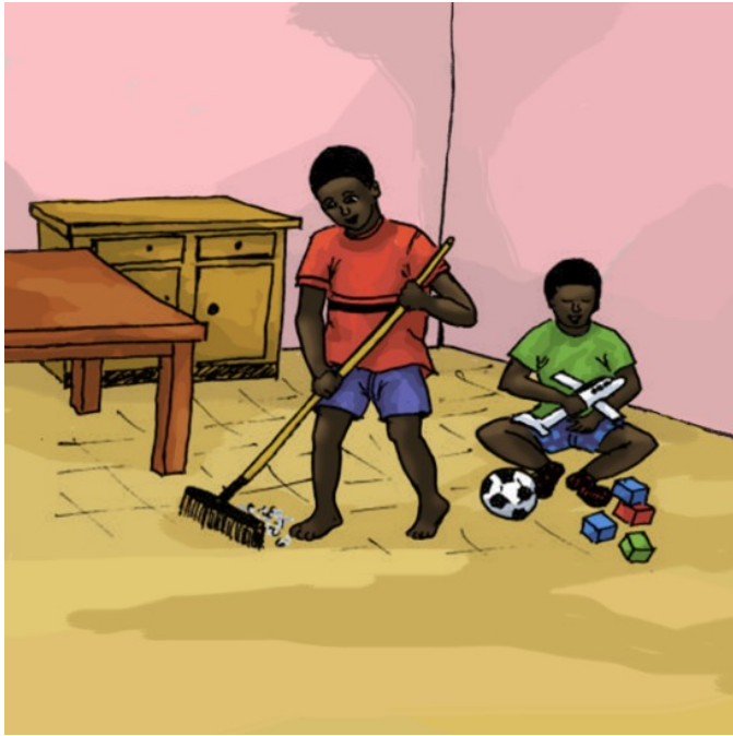
Sibidhka ayaan xaaqaa.