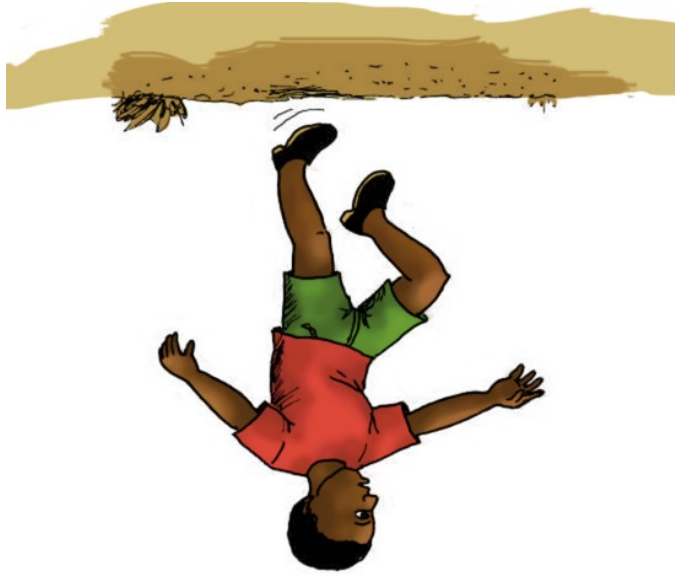
Waan la baxsan karaa.