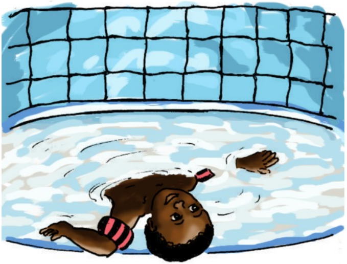
Waan la dabaalan karaa.