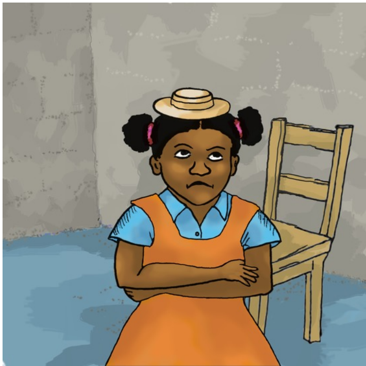
Ten kapelusz jest mały.