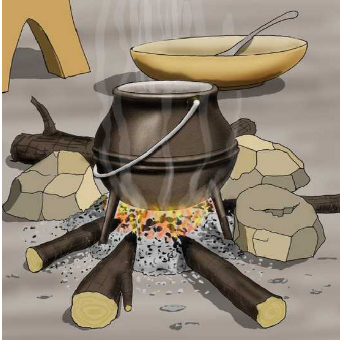
Ibbiddi nyaata bilcheesaa.