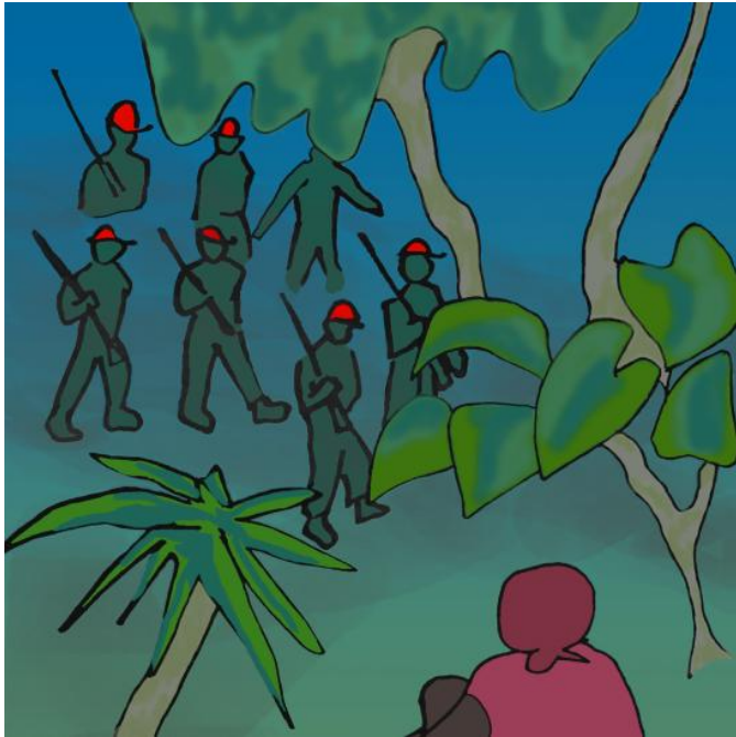
Sanaa booda rayaan nideebi'an.