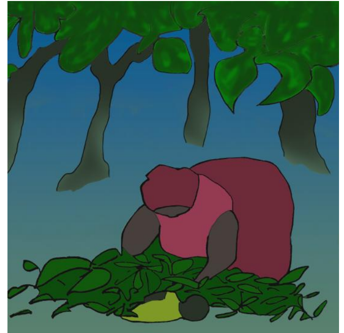
Akkoon Tinigii baala mukaa jala dhoksite.