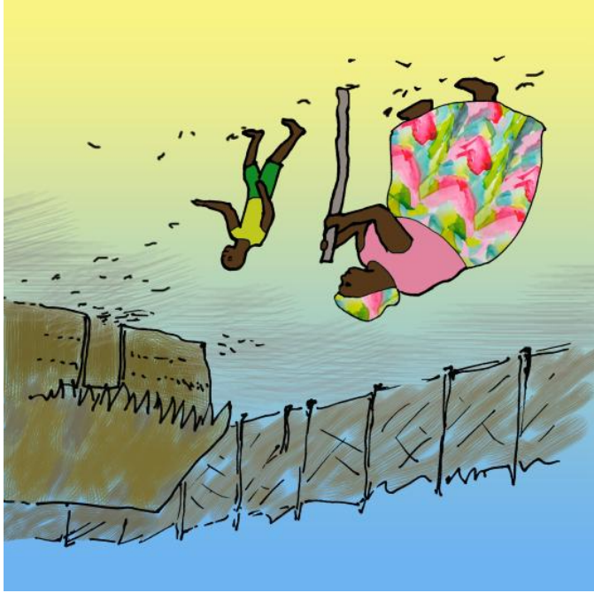
Dafani loo'an gara manaa galan.