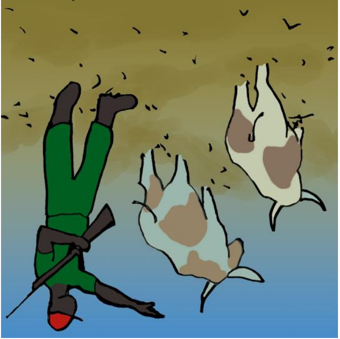
Rayaan sun saawan fudhatan.