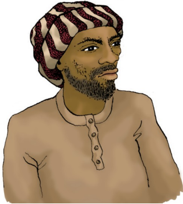
Babaan refeensa hareeda qaba.