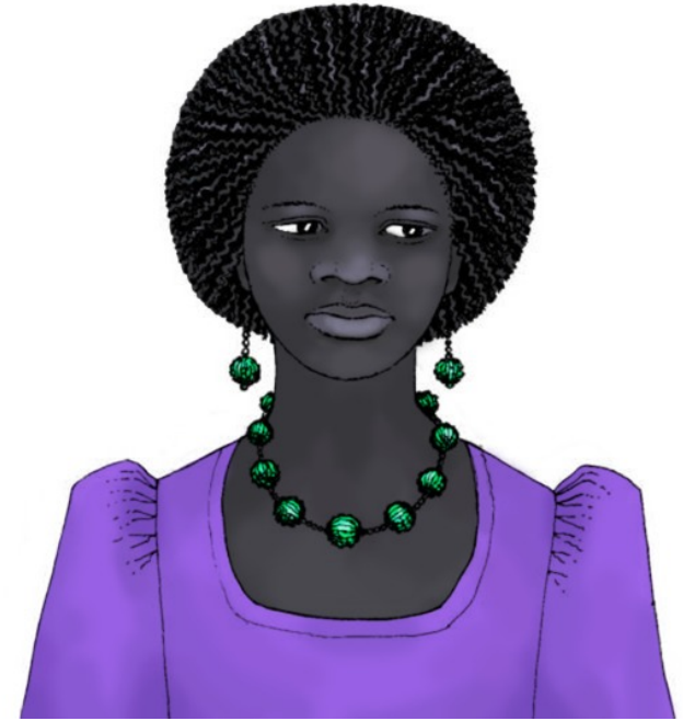
Zaanaleen refeensa ishee filaateera.