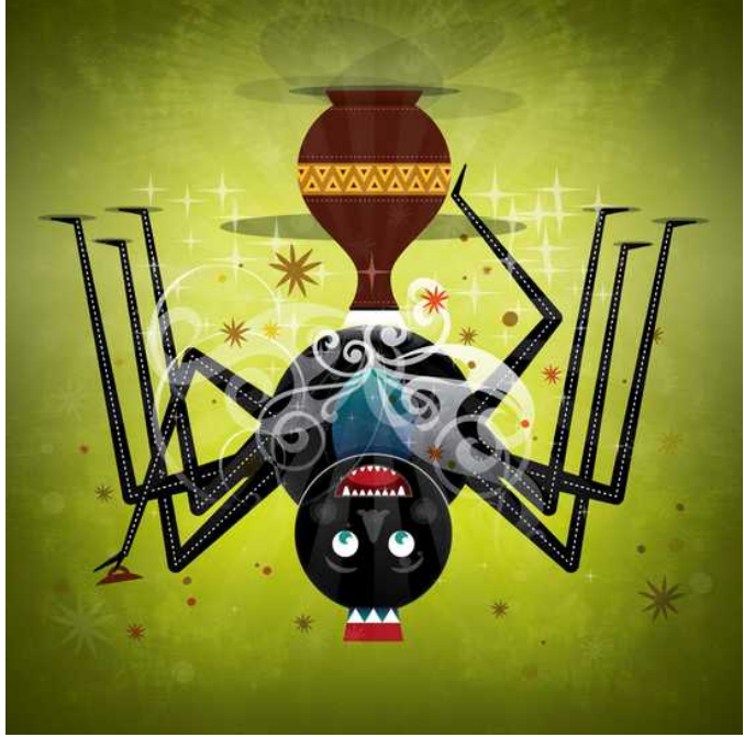
Anaanis fi Ogummaa