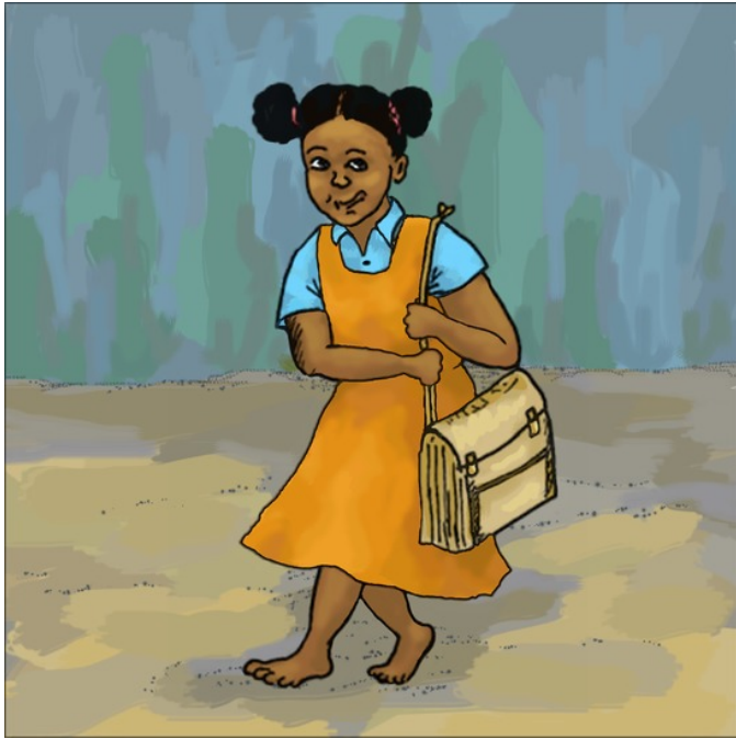
Boorsaan kuni guuddaa dha.