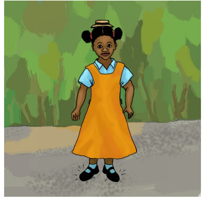
Koppen kuni haalan ta'aa.