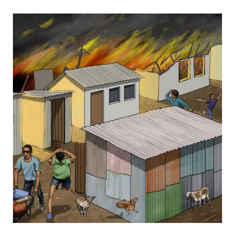
આગ શક્તિશાળિ હોય.