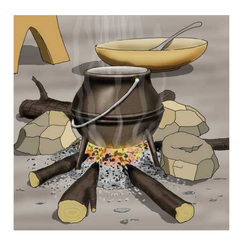
આગ થિ રસોય થાયે.