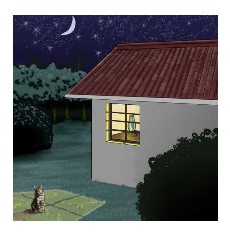
આગ થિ પ્રકાશ આવે.