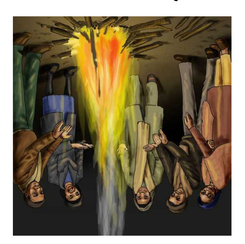
આગ ગરમ હોય.