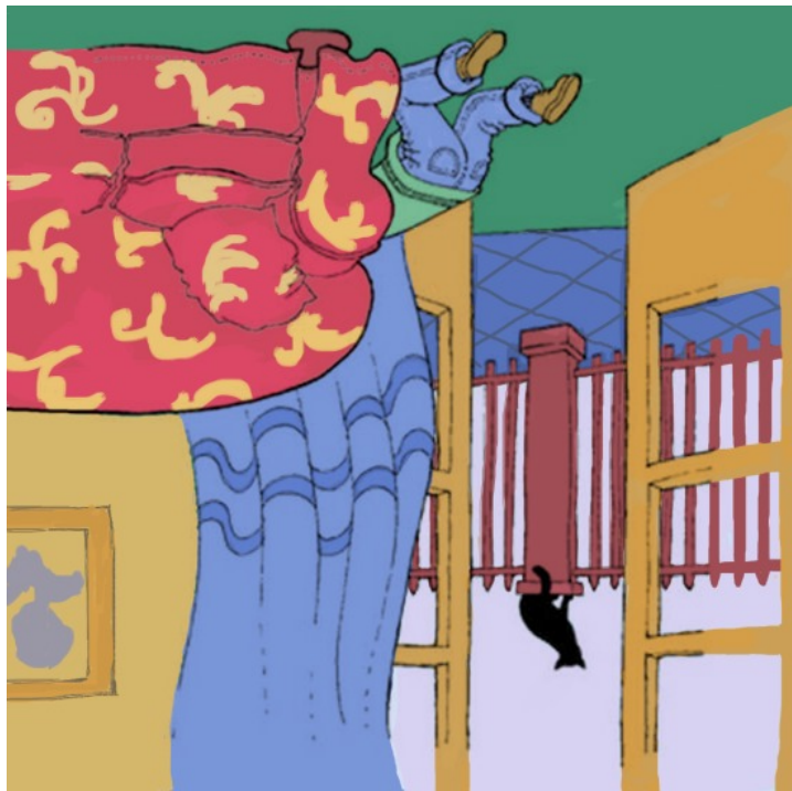
Հիշե՛ք տնային կենդանիները և ի՞նչ անե՛ք