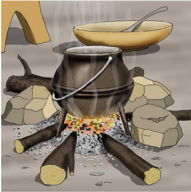
Le feu cuit.