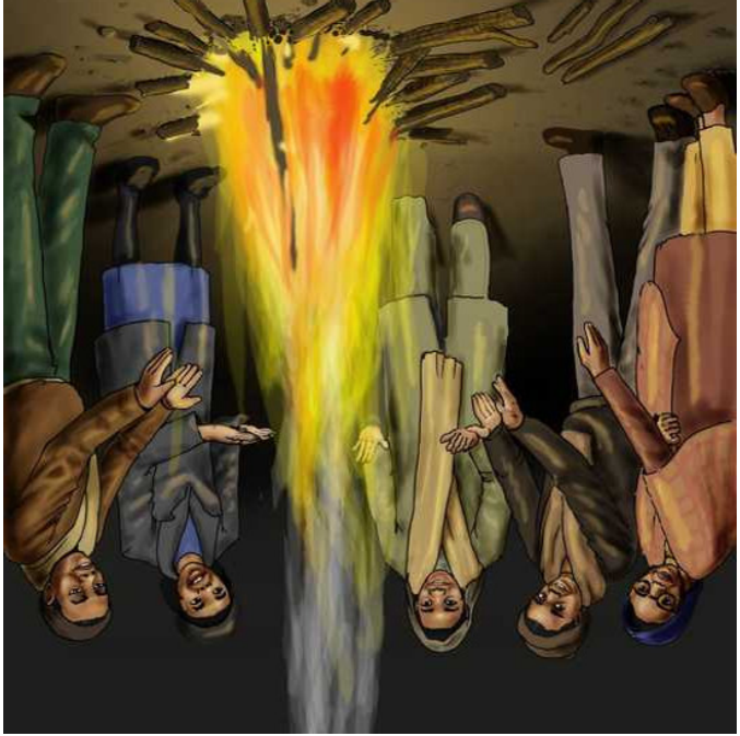
Le feu donne de la chaleur.