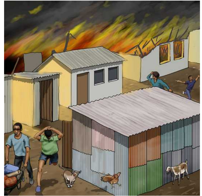
Et il est puissant.