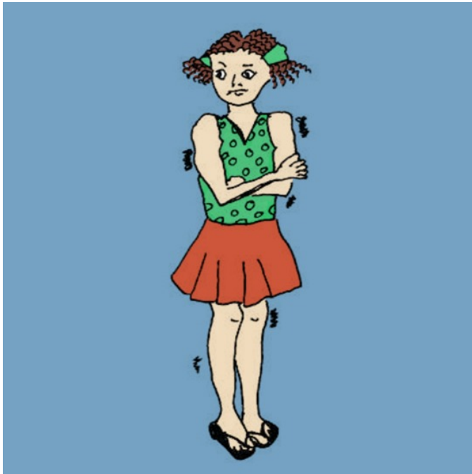
Il fait froid.