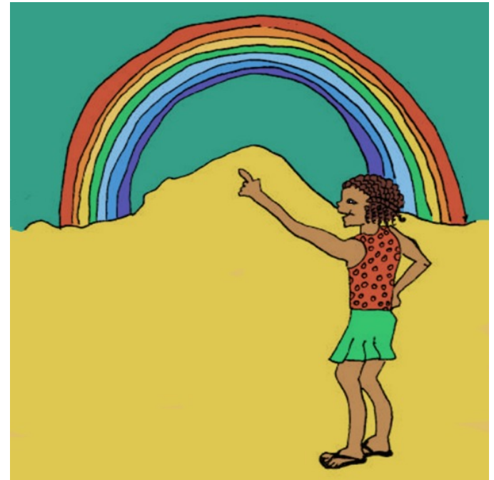
Je vois un arc-en-ciel.