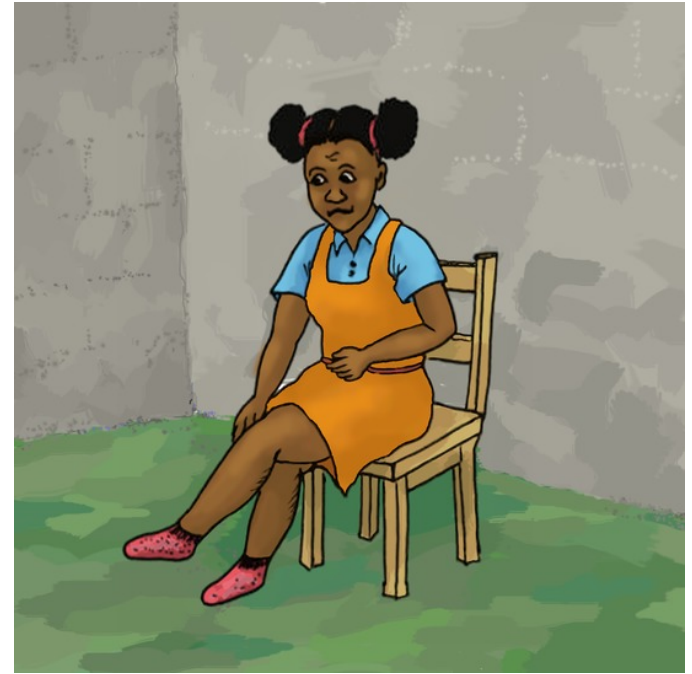
Los calcetines son cortos.