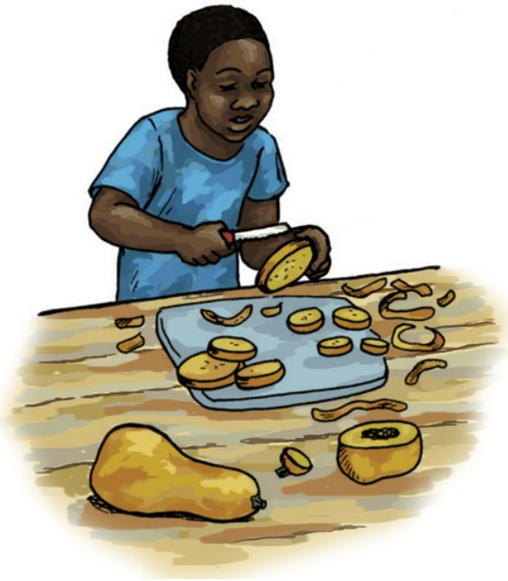
I cut the butternut.