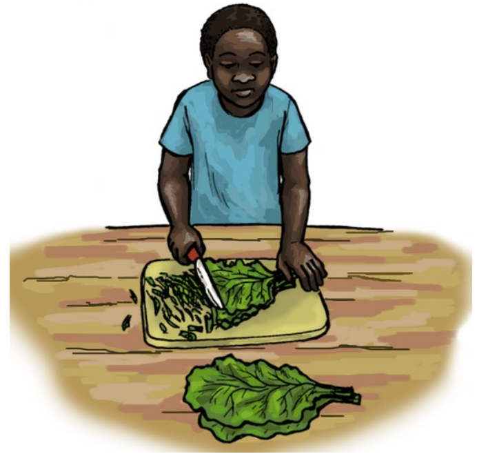
I chop the spinach.