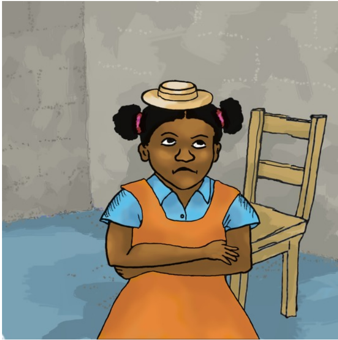
This hat is small.