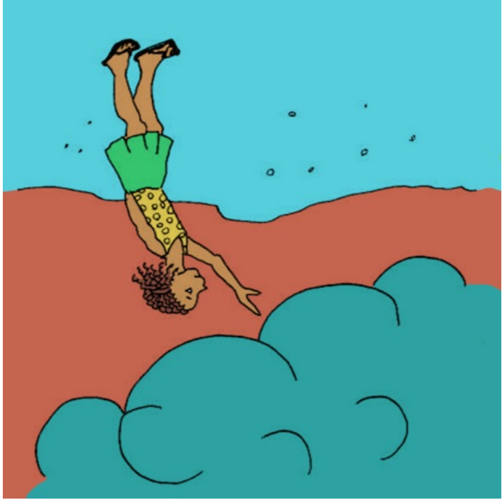
। ଧନୁ ଧରାଧରା