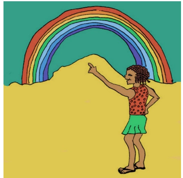
ቀስተ ደመና ይታየኛል።