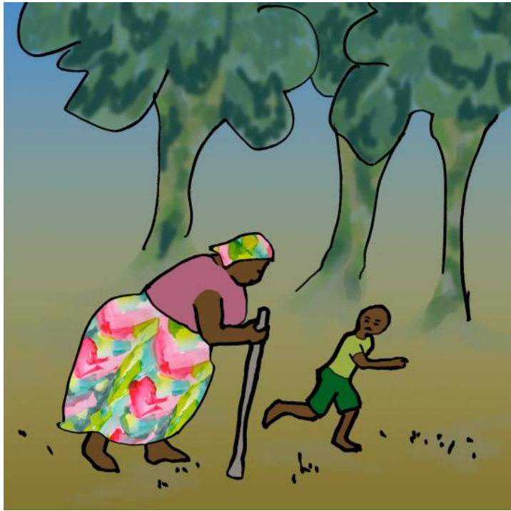
ቴንጊና አያቱ ሮጠው ተደባቁ።