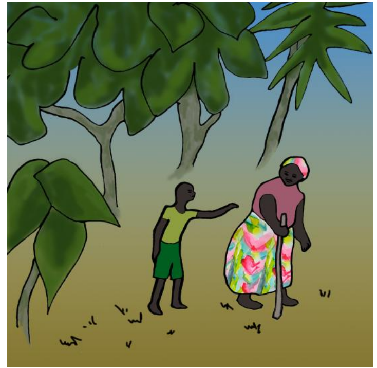
ሲረጋጋ ቴንጊና አያቱ ወጡ።