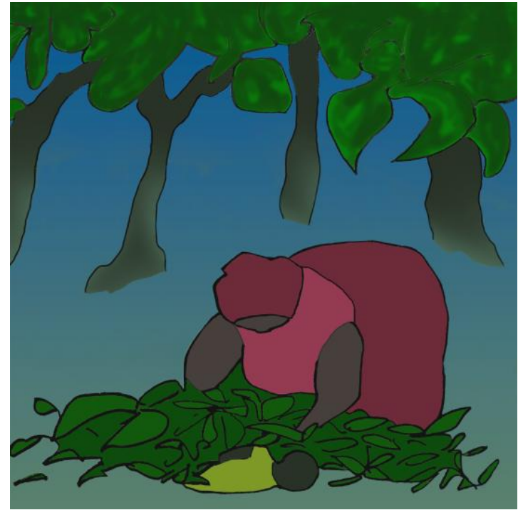
እያቱ ቲንጊን ቅጠል ውስጥ ደበቀችው።