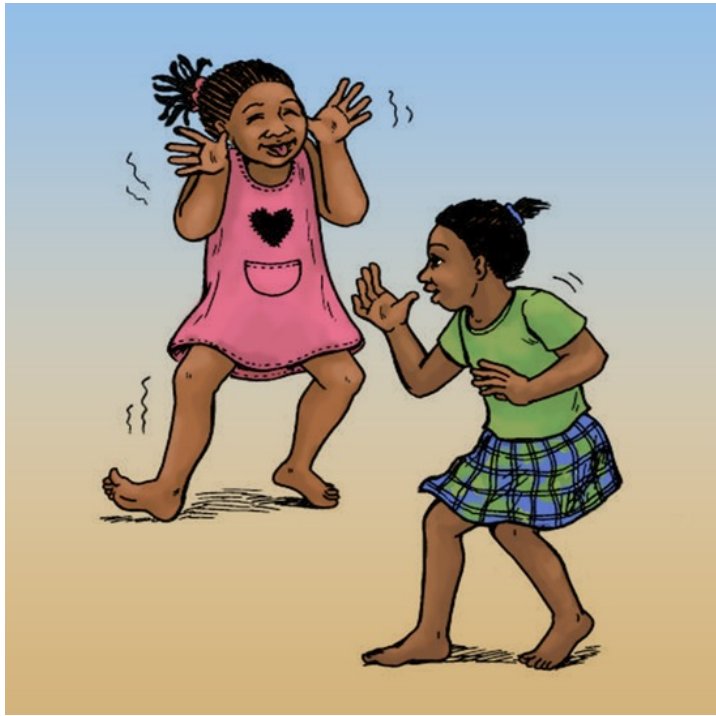
ከጓደኛዬ ጋር ስጫወት ቂልነት ይሰማኛል።