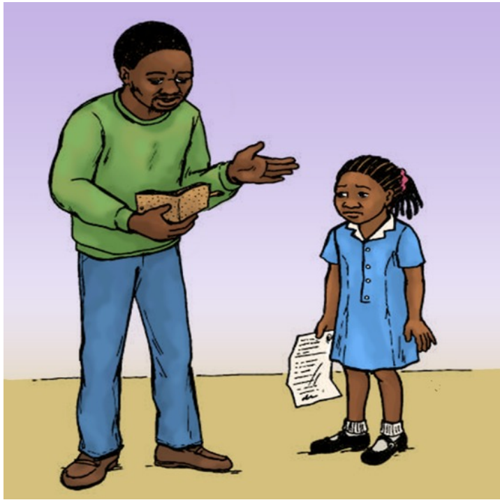
አባቴ ብር የለኝም ሲል ብስጭት ይሰማኛል።