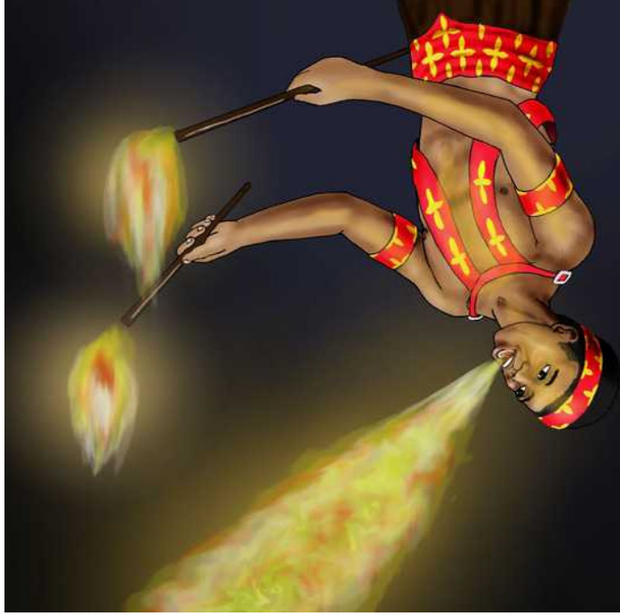
Lũa Le feu

This work is licensed under a Creative Commons Attribution 3.0 International License. https://creativecommons.org/licenses/by/3.0