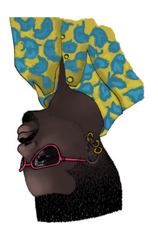
Thabo vừa cắt tóc.