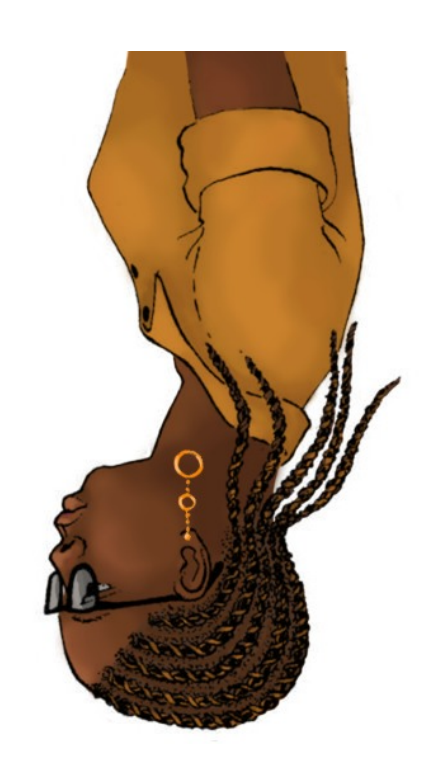
Zama vừa tết tóc.