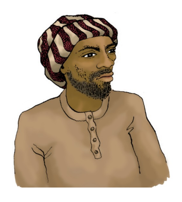
Baba có râu.