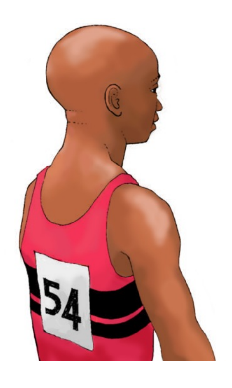
Thema vừa cạo đầu.