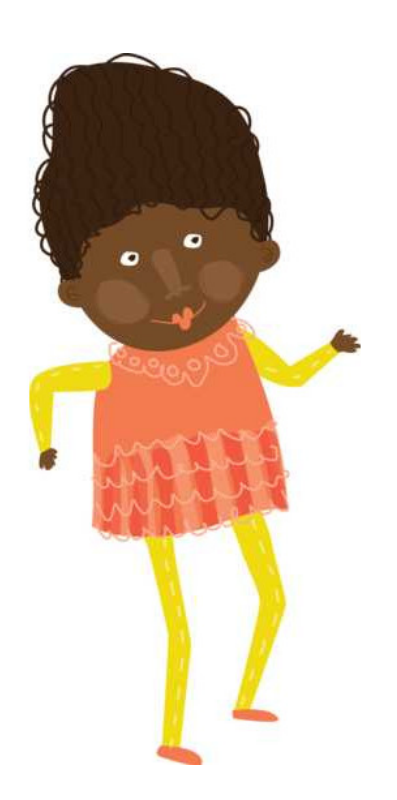
Wewe unafanya nini?