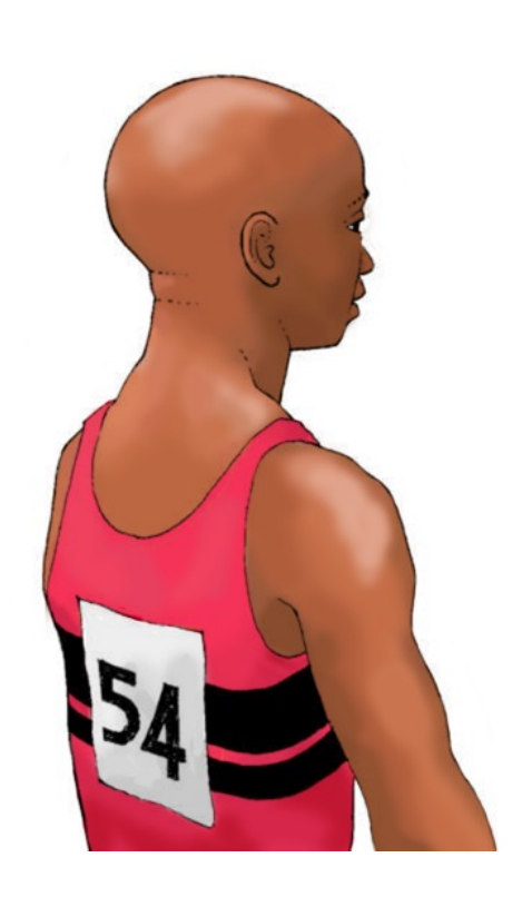
ثِيمْبَا أَزَالَ شَعْرَهُ.