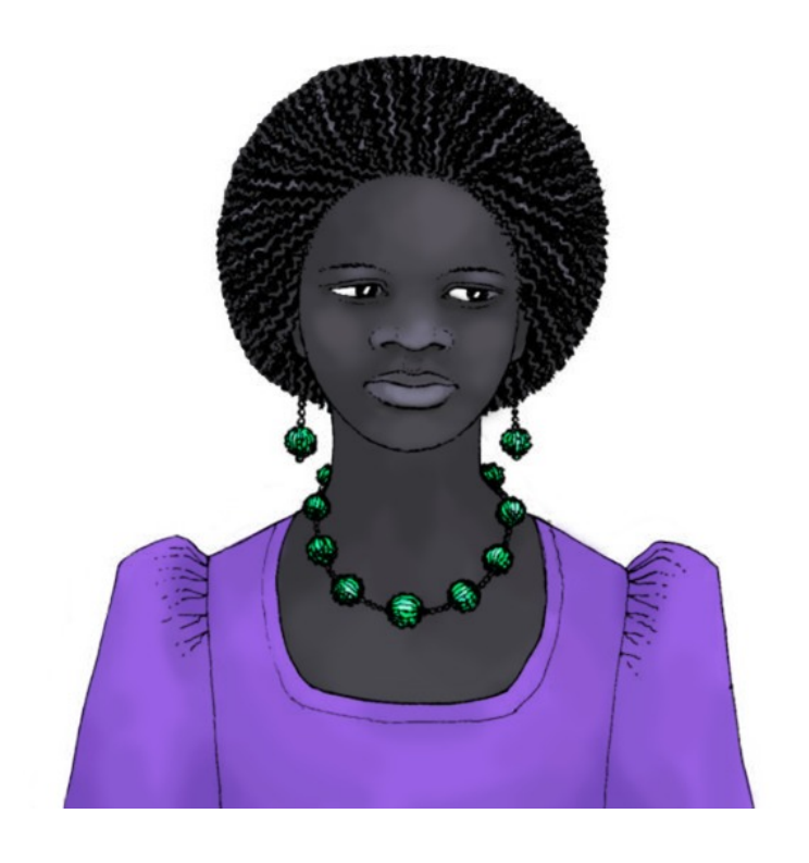
زَانِيلِي مَشَطَتْ شَعْرَهَا.