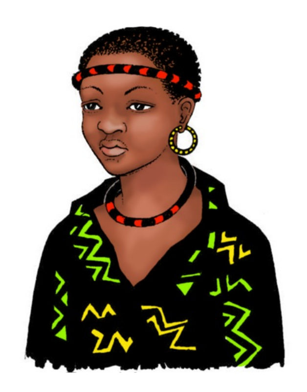
ثَلِي لَدَيْهَا شَعْرٌ قَصِيرٌ.