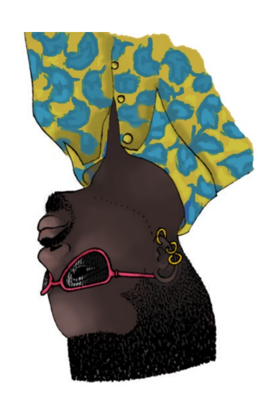
ثِيبُو قَصَّ شَعْرَهُ.